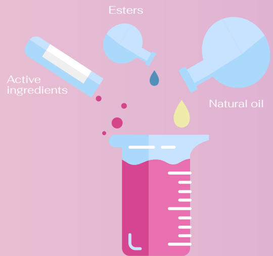
BaseMe® Skin tonic Cortina